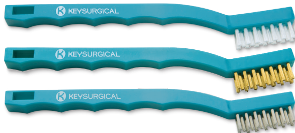
TOOTHBRUSH-STYLE CLEANING BRUSHES